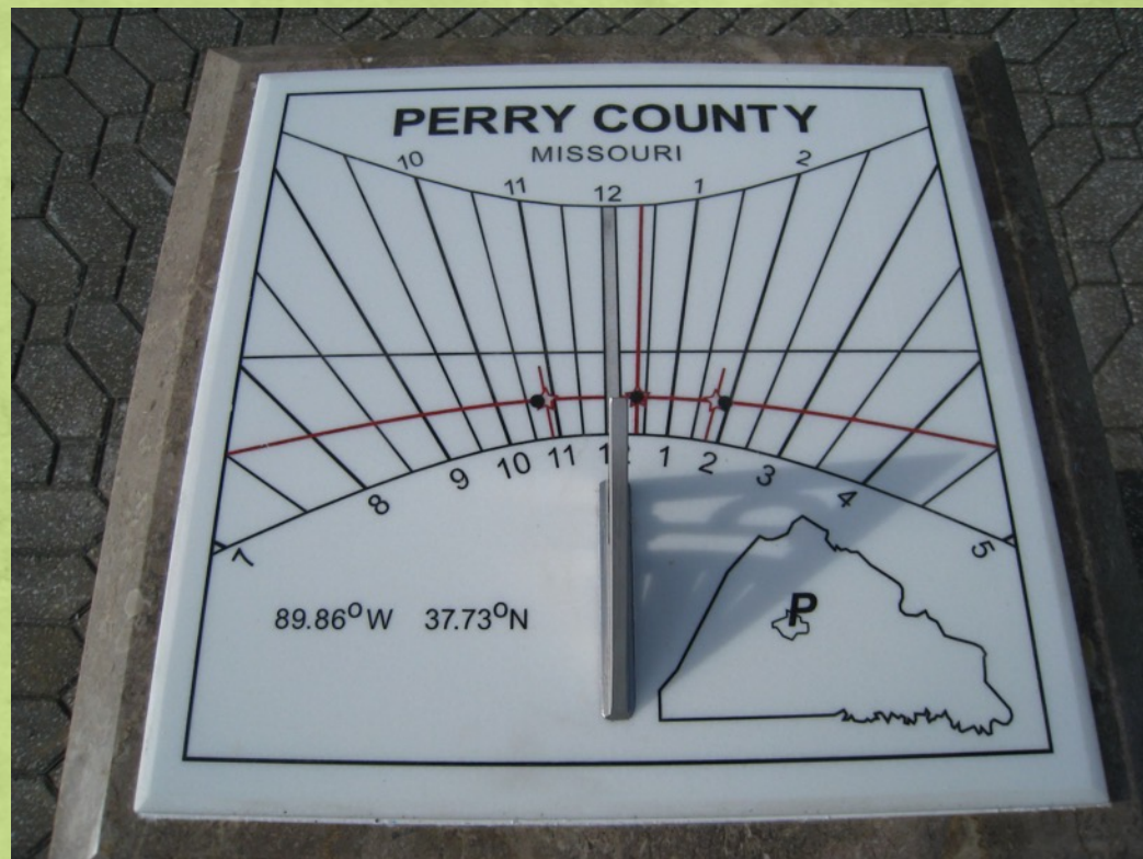
Perry County Commemorative Eclipse Sundial 2017/2024