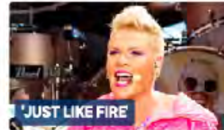
Man's concert experience cut short after his sign catches Pink's attention