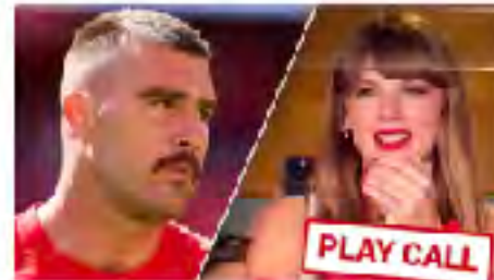
Travis Kelce dishes on 'what's real' amid Taylor Swift romance rumors