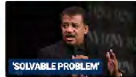
Neil deGrasse Tyson explodes during debate on trans athletes competing in women's sports