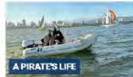
Seabound bandits terrorize locals as homeless camps surge nearby