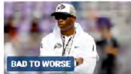
More trouble for Deion Sanders as son hospitalized after brutal defeat