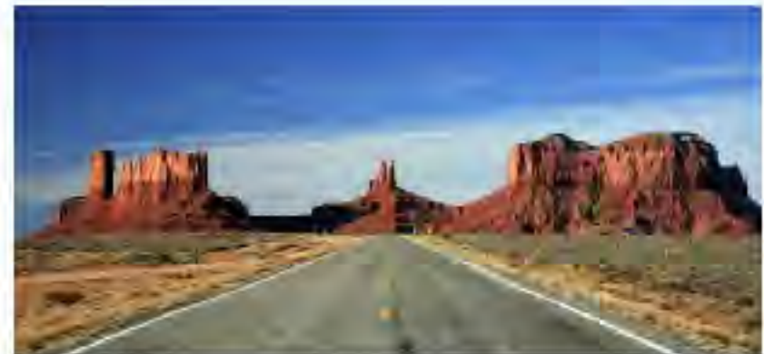
Monument Valley