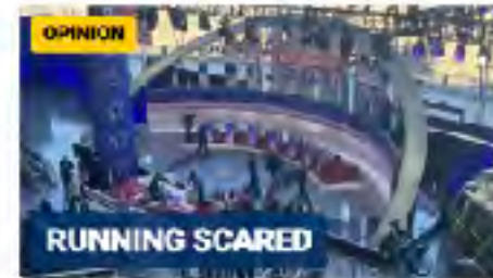
The Republican elephant that won't be in the room at tonight's debate – and it's not Trump